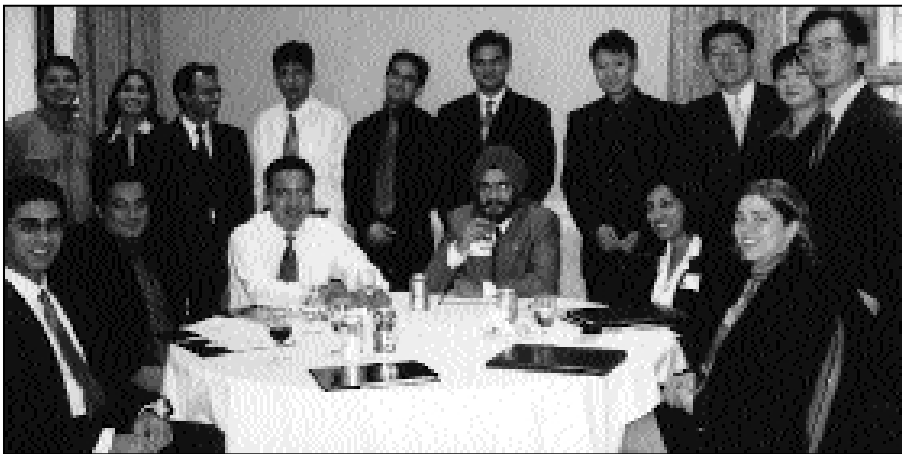
A group of the MBA applicants between interview sessions