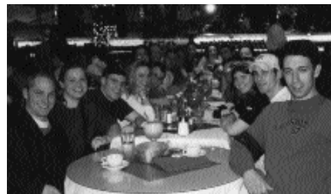
Dinner on Friday at Mi Tiera at Market Square