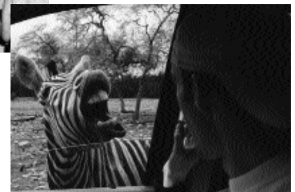
"Open wide for a Scooby snack!"—Natural Bridge Safari