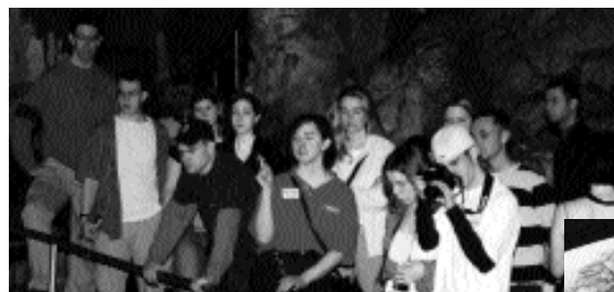
Mesmerized by the Natural Bridge Caverns